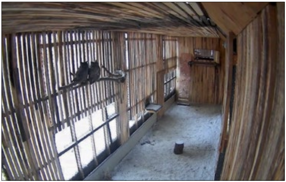
Figure 1. Non-releasable wild adult Great Horned Owls in the breeding and release training facility near Houston, Minnesota.

Dispersal and Survival of Three Captive-bred Great Horned Owls Bubo virginianus in Southeastern Minnesota