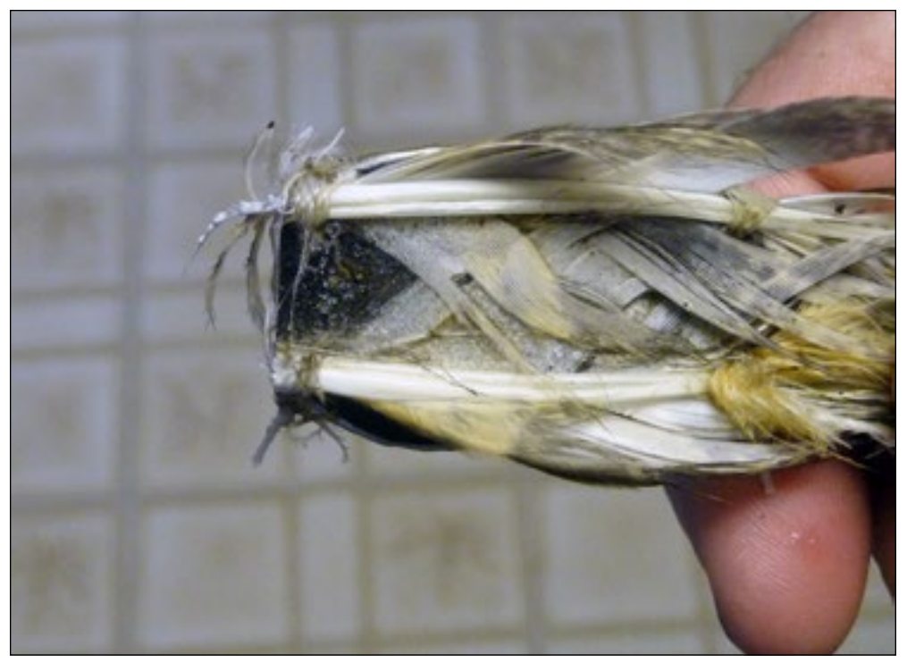
Figure 5. Transmitter from the male owl, Patrick, showing rectrices broken at the upper points of attachment.

of her wintering area and about 25 km north of the release site. She remained in an area 4.4 km long by 1.6 km wide until we could no longer find her signal. The last signal recorded was on 31 May 2014.