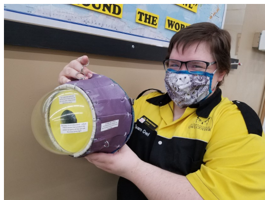
Created an anatomically accurate giant owl eyeball replica.