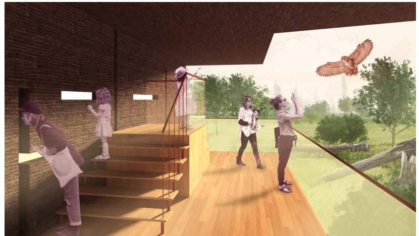
Held an architectural contest to address challenging design needs for our future facility.