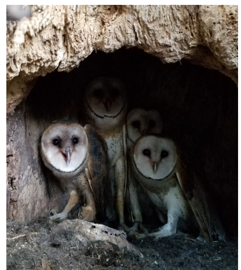
Documented Barn Owls in five locations in southeastern Minnesota and the first Barn Owl nest in Wisconsin in 22 years