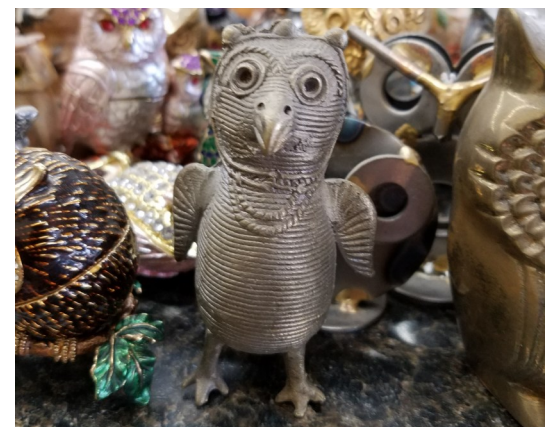
Catalogued the Krohn collection of owl memorabilia from around the world.