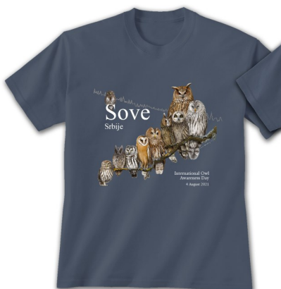
Created an "Owls of Serbia" T-shirt for International Owl Awareness Day, with half of all profits going to owl education in Serbia.