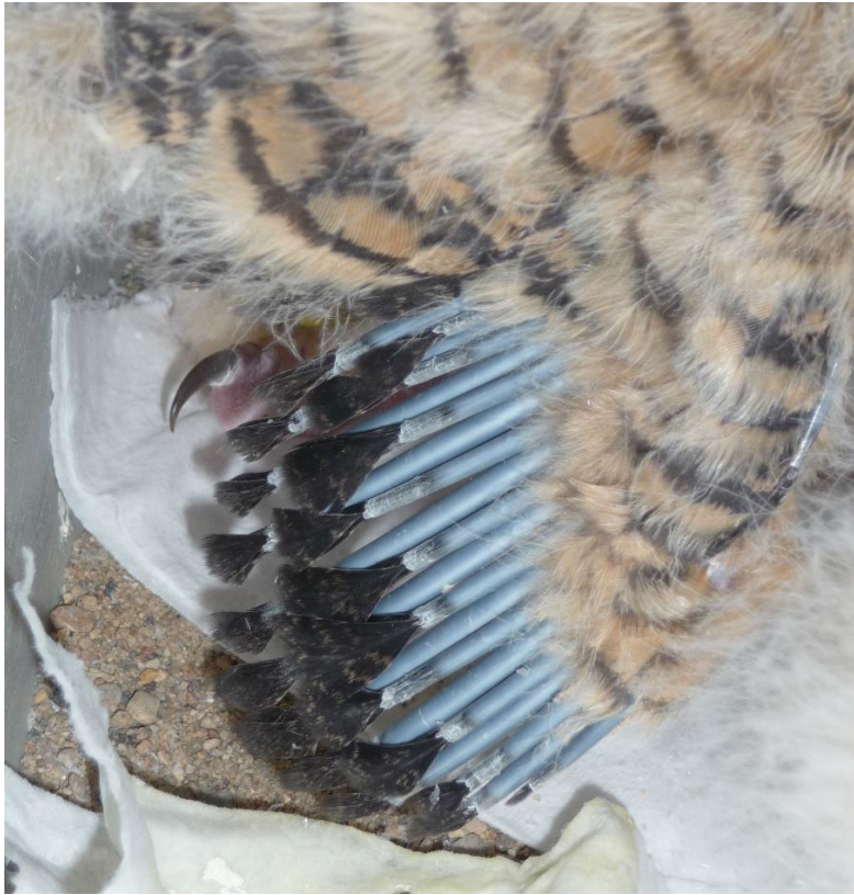
About 3-week-old owlet (2014)