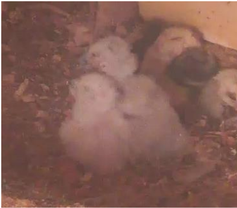
6-day-old female, 3-day-old male (2017)