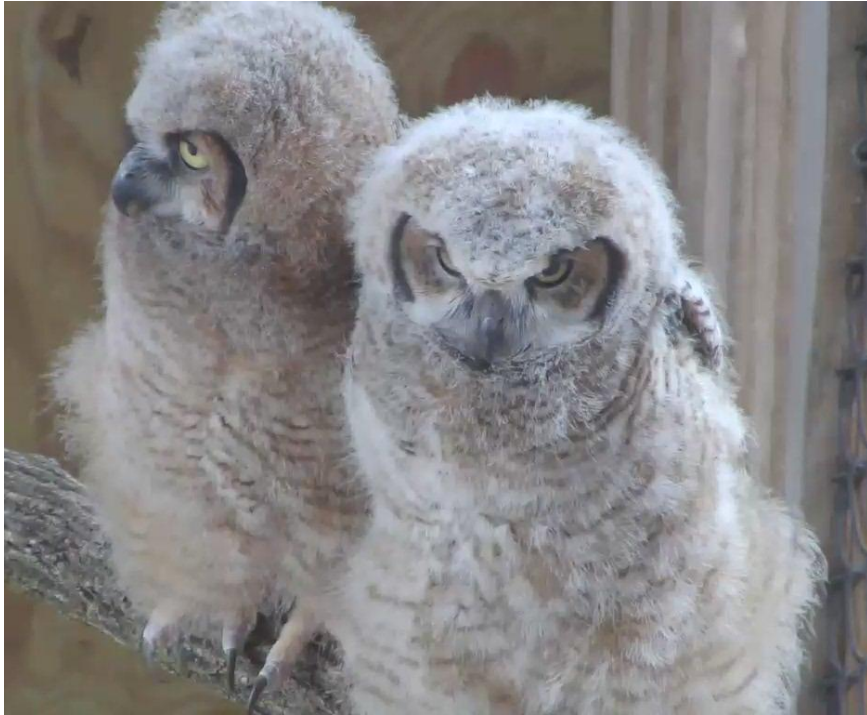
7-week-old female and male (2014)