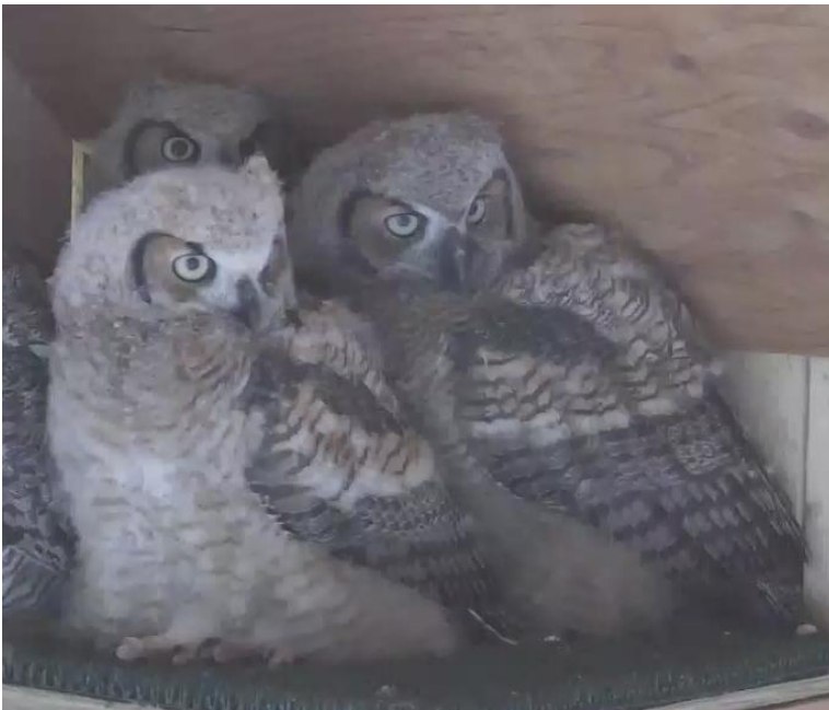
9- to 9.5-week-old (two) females and a male (2013)