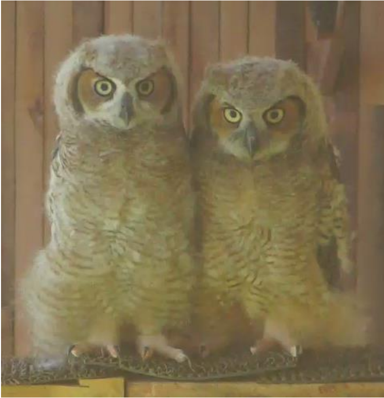
8.5-week-old female and male (2017)