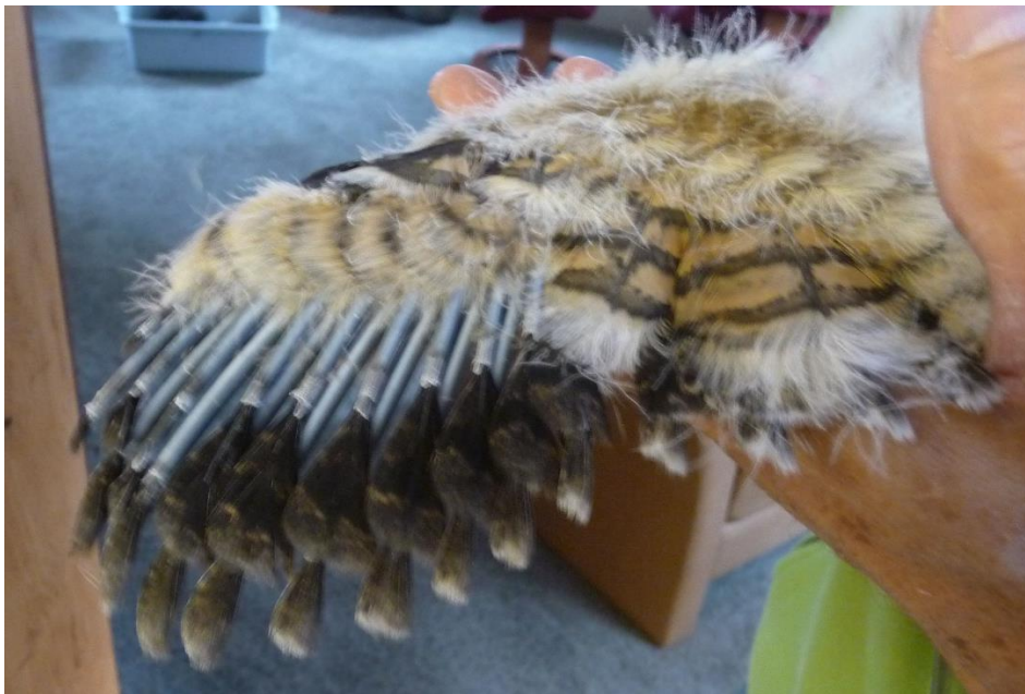
3.5-week-old owlet (2014)