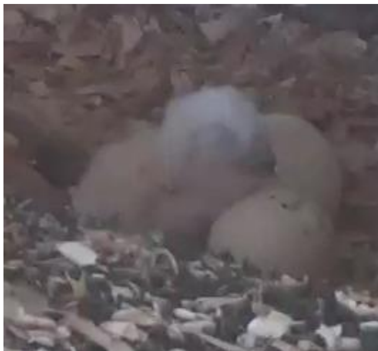
2-day-old female (2013)