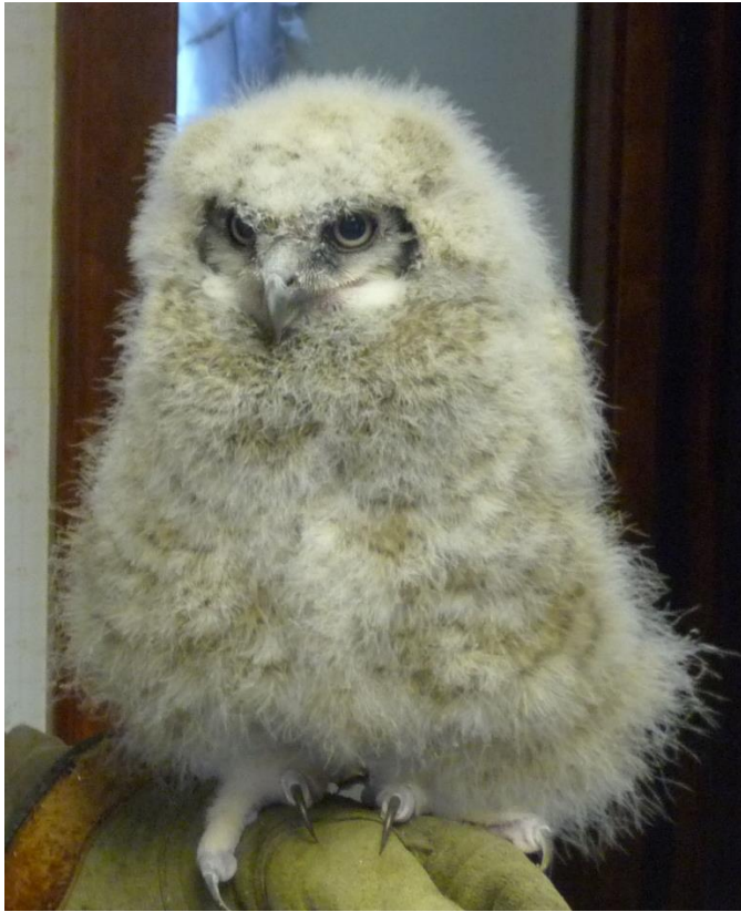
25-day-old male (2014)