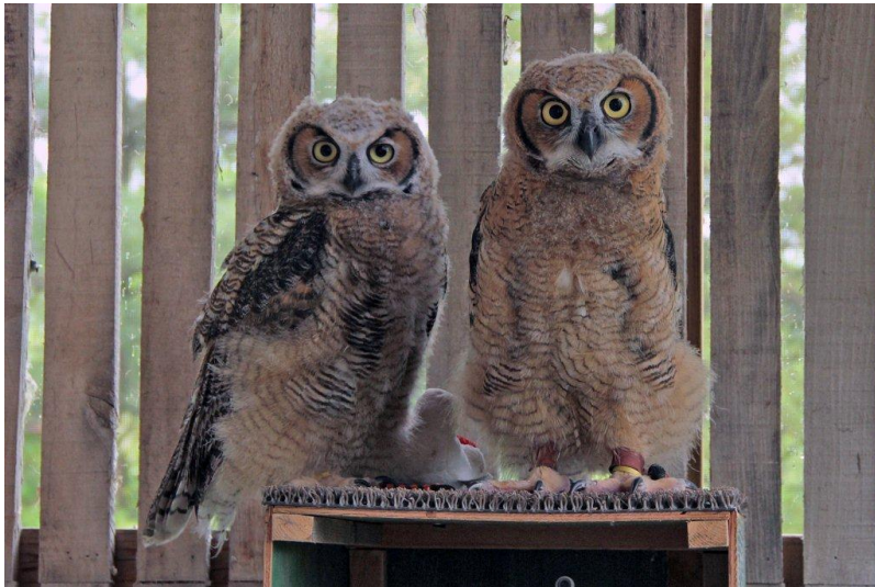
12-week-old male and female (2014)