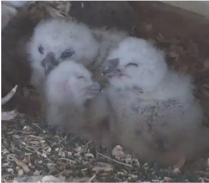
14-day-old female, 12-day-old male, 8-day-old female (2013)