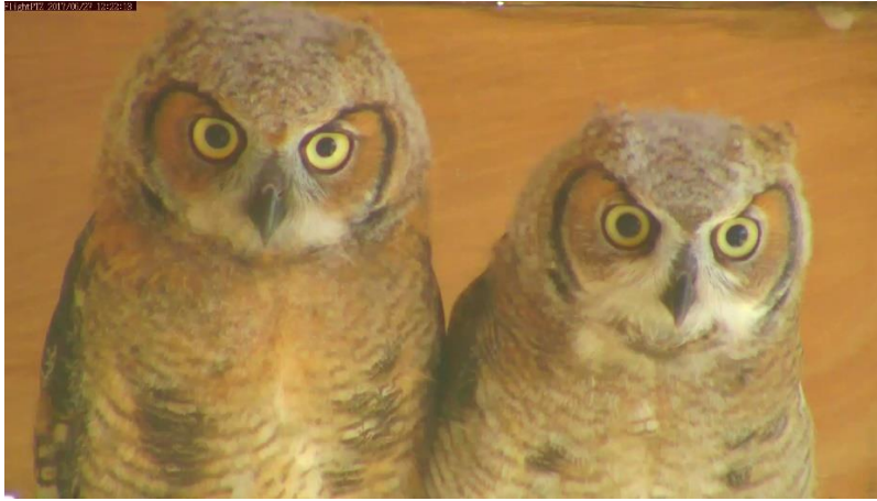
12-week-old female and male (2017)