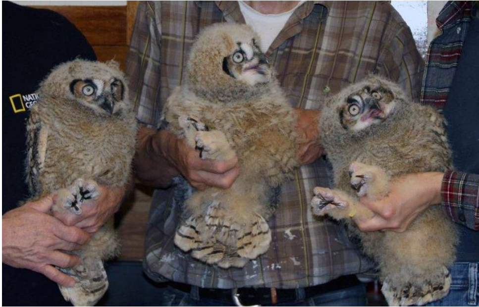
44-day-old female, 42-day-old male, 38-day-old female (2013)