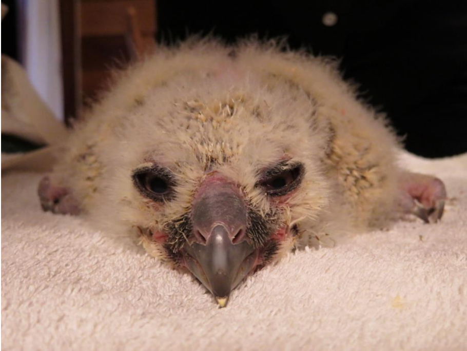
12-day-old female (2017)