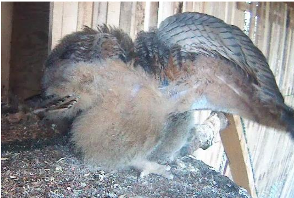
48-day-old female (2017)