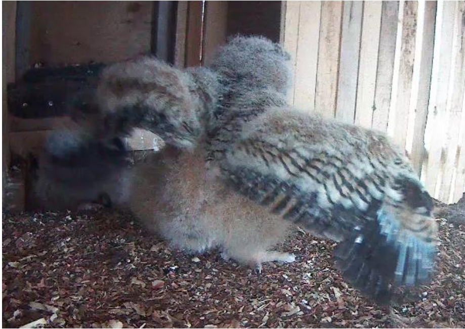
28-day-old female (2017)