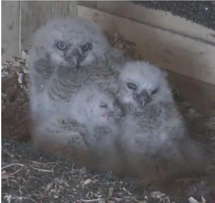
20-day-old female, 18-day-old male, 14-day-old female (2013)