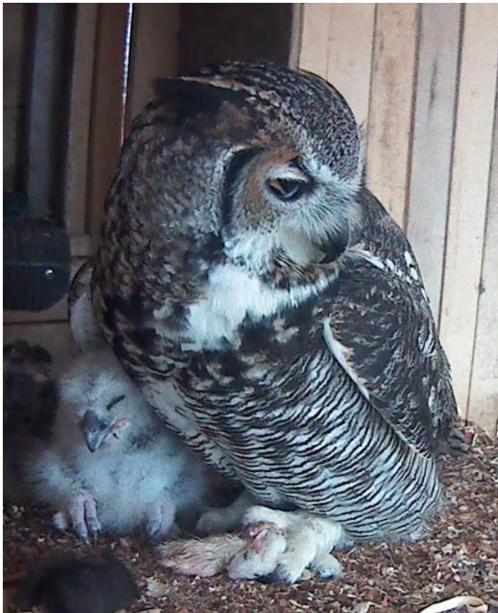
14-day-old male with mother (2017)