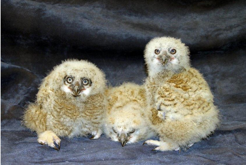
25-day-old female, 23-day-old male, 19-day-old female (2013)