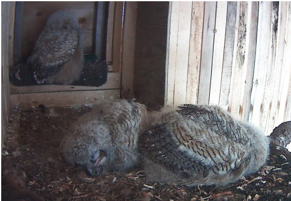
37-day-old female, 35-day-old male, 31-day-old female (2013)