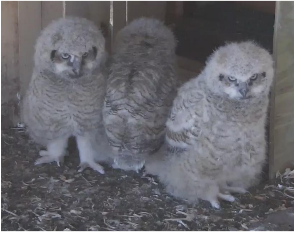
36-day-old female, 34-day-old male, 30-day-old female (2013)