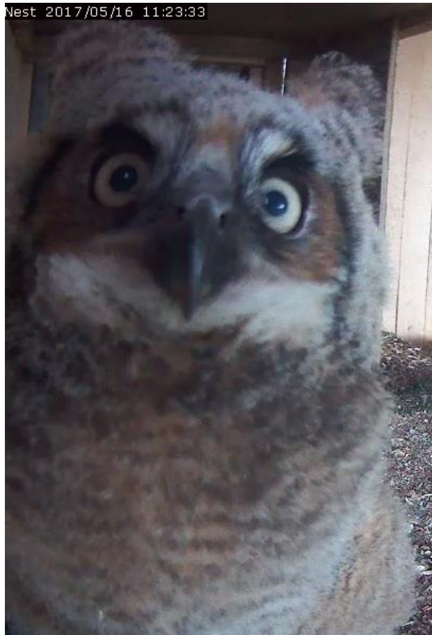
50-day-old female (2017)