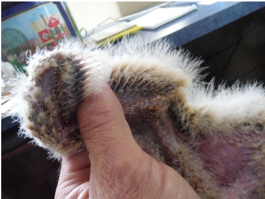
2-week-old owlet (2014)