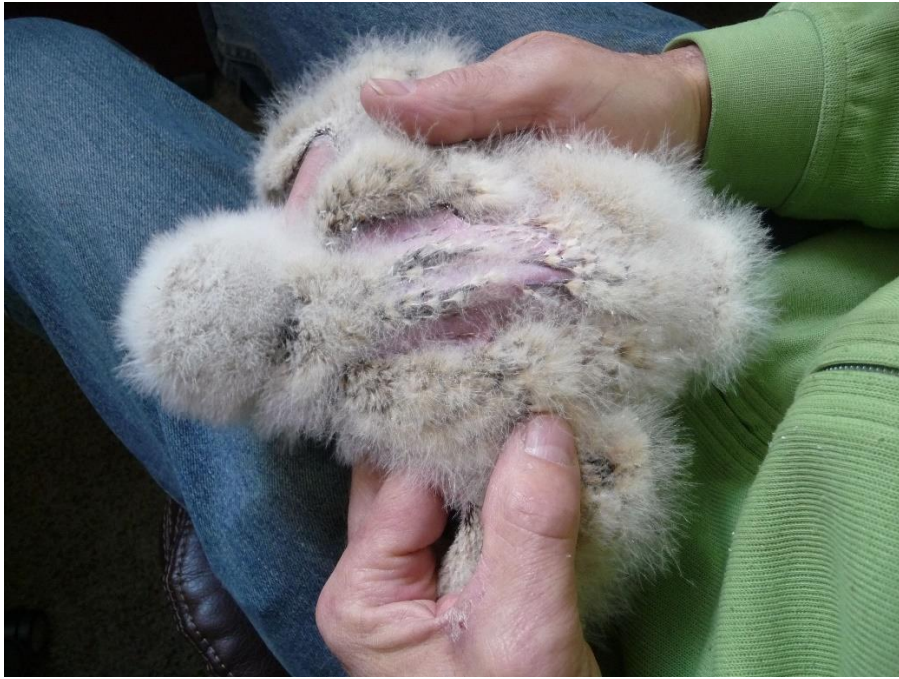
2-week-old owlet (2014)