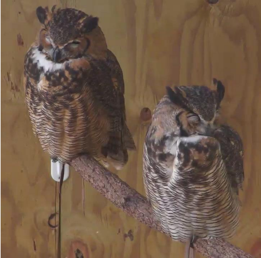
26-week-old female and male (2014)