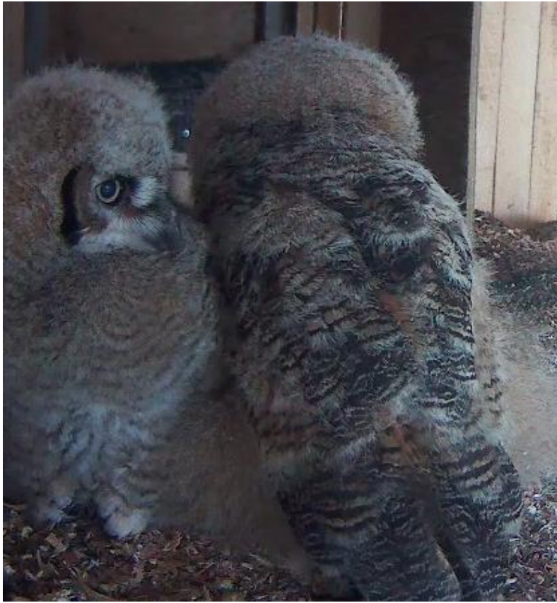
40-day-old male (facing) and 43-day-old female (back view) 2017