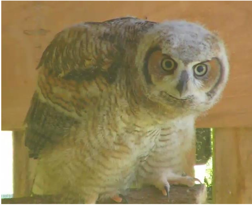
57-day-old male (2014)