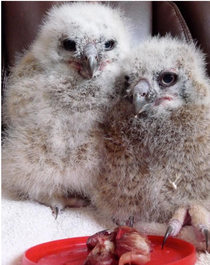
19-day-old male and 21-day-old female (2014)