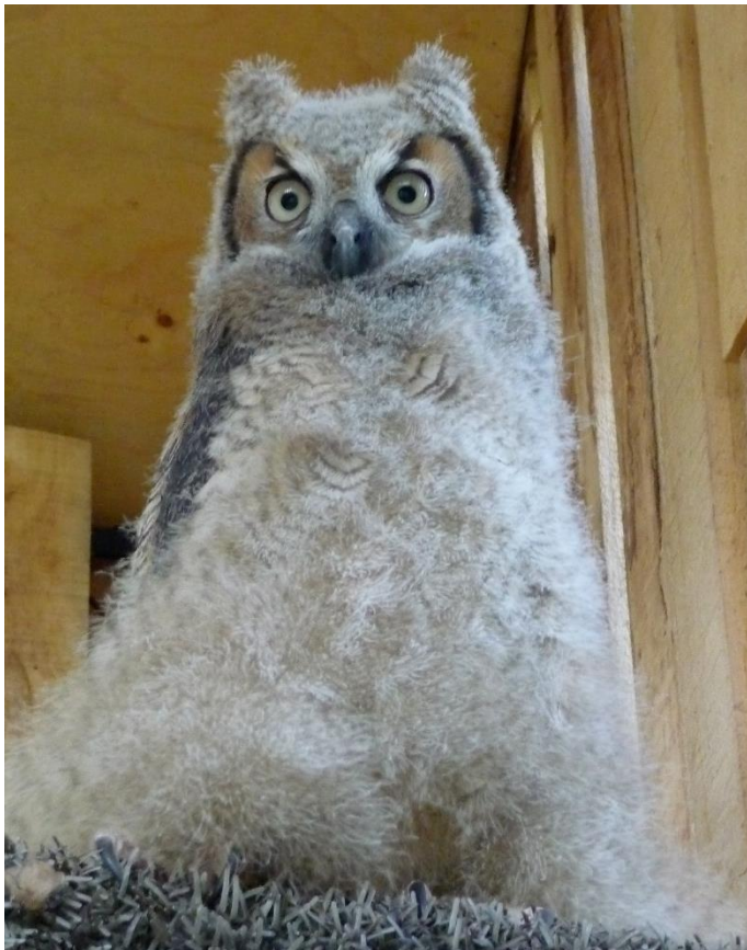
5-week-old owlet (2013)