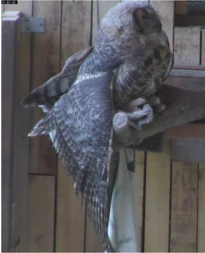
18-week-old owlet (2013)