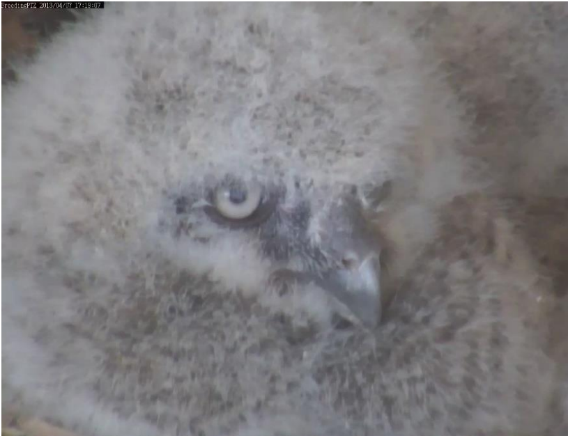
3.5 weeks (2013)