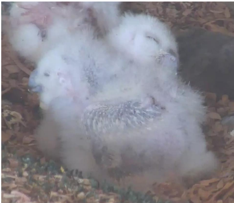
9-day-old female, 6-day-old male (2014)