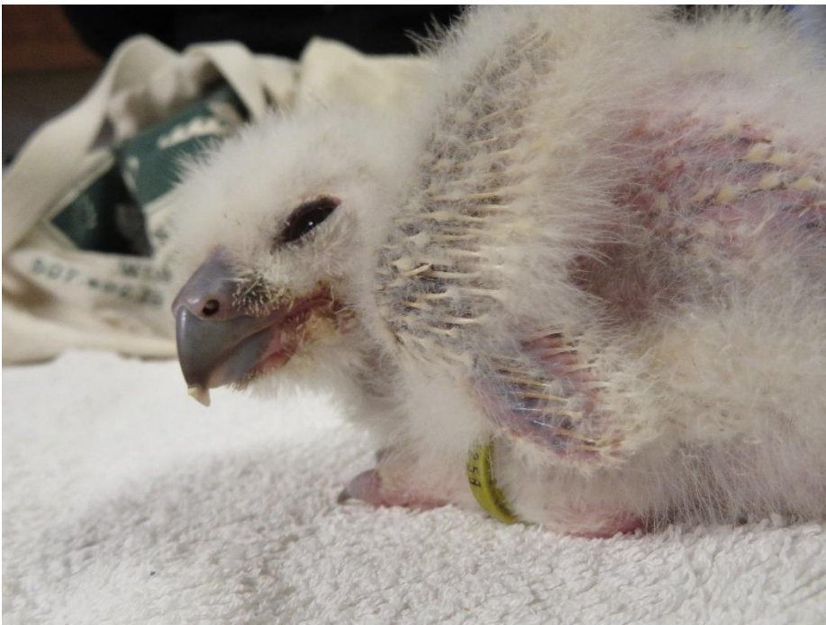
9-day-old male (2017)