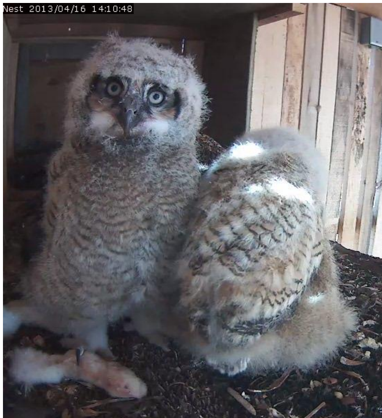
32-day-old female (facing) 30-day-old male (tail view) 2013