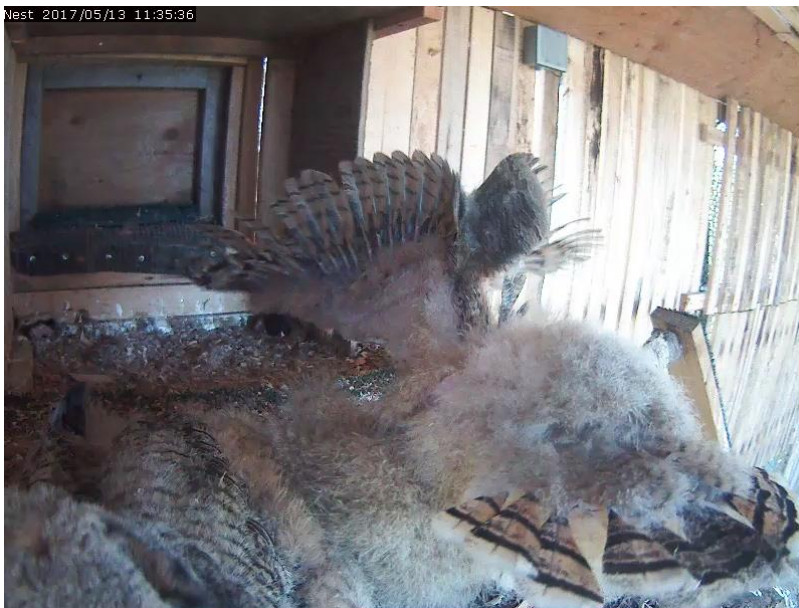
38-day-old male stretching (2017)