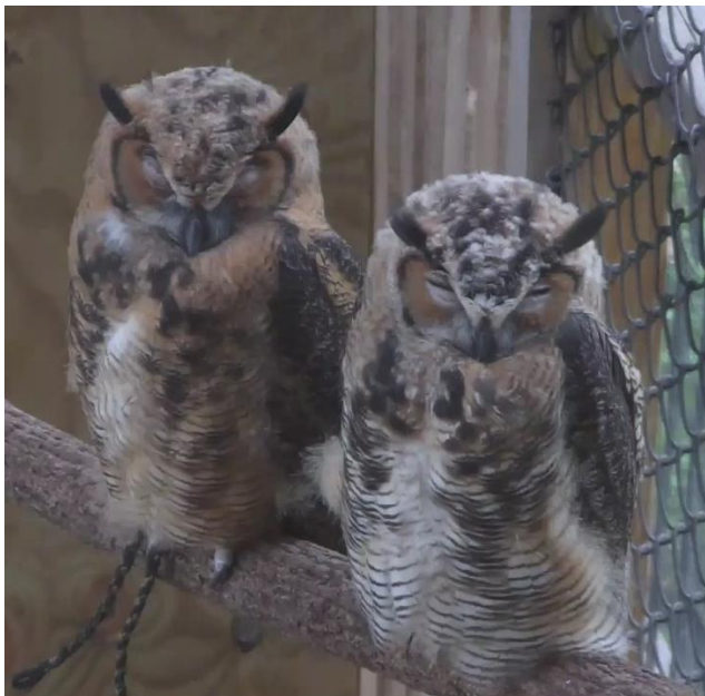
15-week-old female and male (2014)