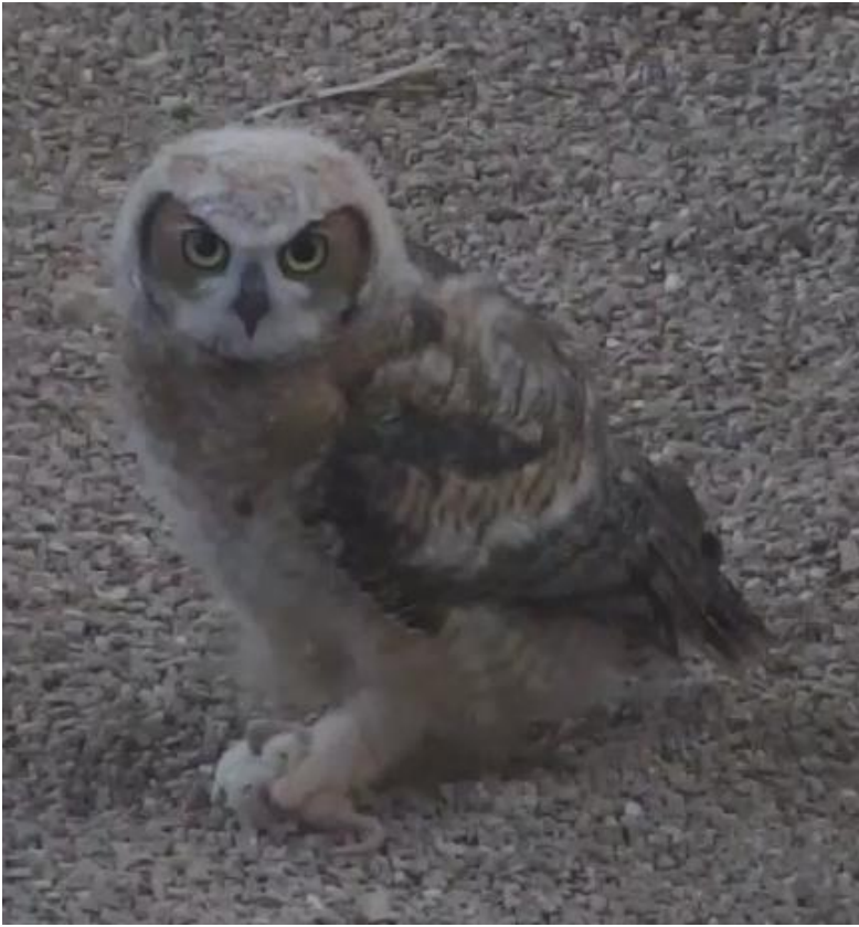
11-week-old male (killing live prey) 2013