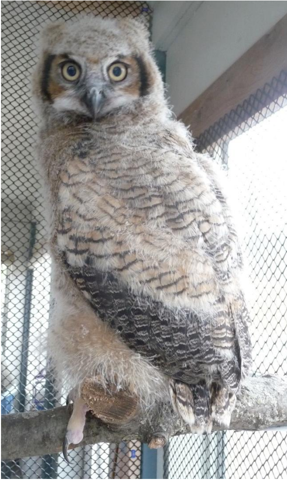
37-day-old male (2014)