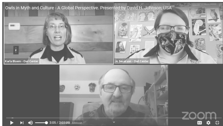
Continue our free Virtual Owl Expert Speaker Series.