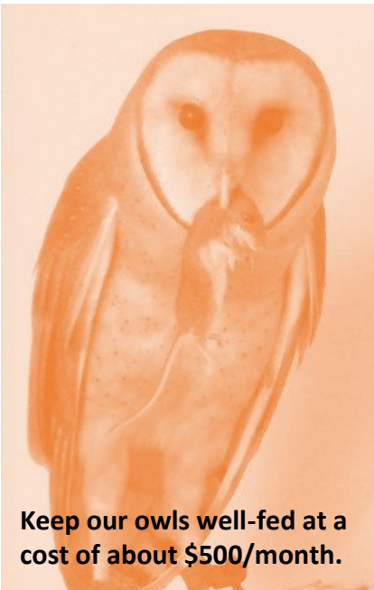
Keep our owls well-fed at a cost of about $500/month.