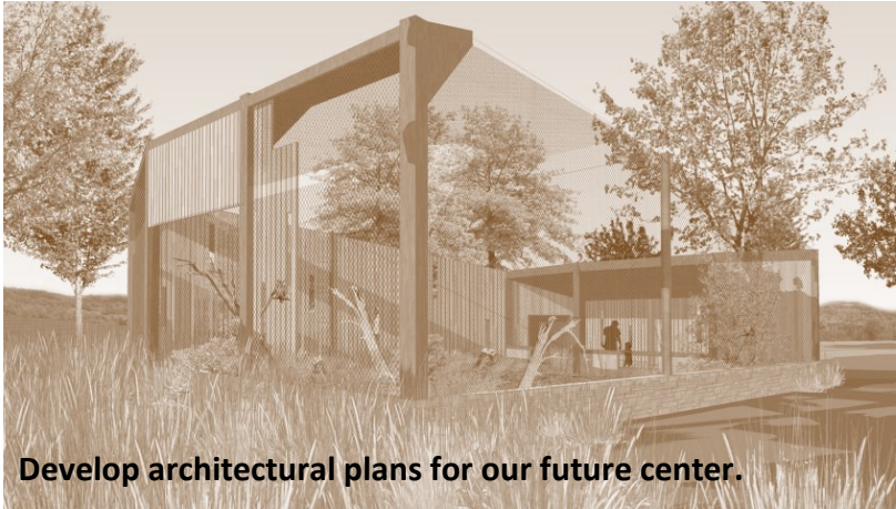
Develop architectural plans for our future center.