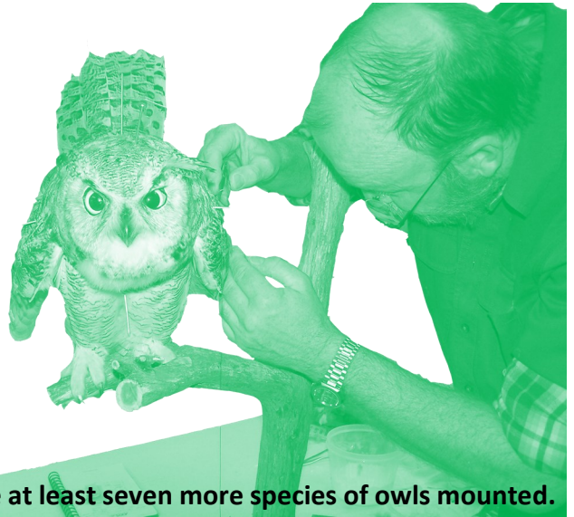
Have at least seven more species of owls mounted.